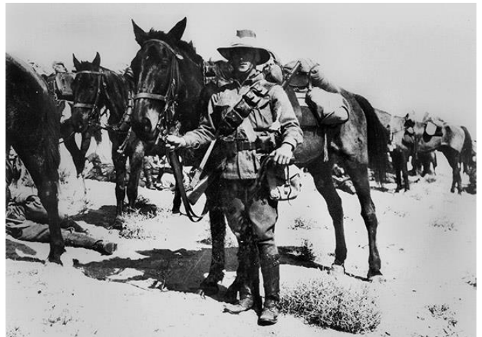
Member of the Australian 2 nd Light Horse

The traditional strategy for the Light Horse—to dismount and attack with rifles from a distance—would leave the men vulnerable to shrapnel fire on the open plains surrounding Beersheba. General Grant devised a different approach; they would attack like a cavalry unit, bayonets in hand like sabres.