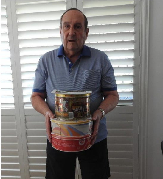
Preparing to leave for the Police Station

Christmas Gift to Southport Police. Every year the Sub Branch says thank you to the men and women at the Southport Police Station by delivering tins of chocolates and biscuits to the station. The delivery is made on Christmas morning so that the officers that are on duty that day have something to cheer their day along.