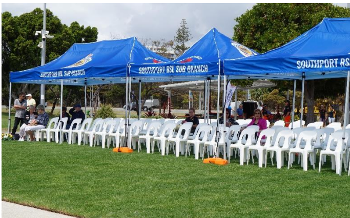
Our New Gazebos in Use

Remembrance Day 2023. The weather was to be fine—that is what the weatherman said. The morning started with a heavy shower of rain and when it stopped, it was very overcast with thick dark clouds everywhere. However, following that first burst of wet weather, we had no more rain and a gentle breeze to cool things down a bit.