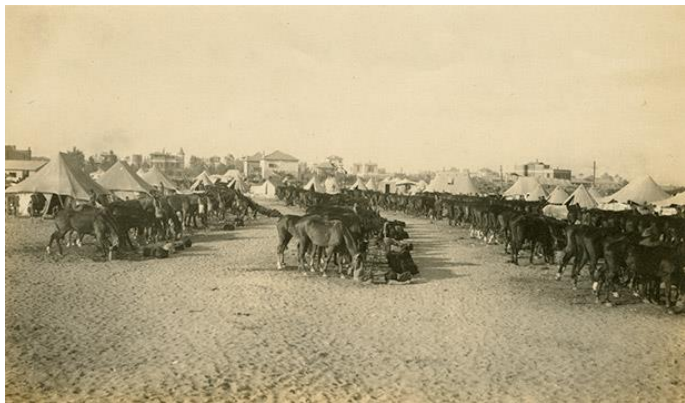
Camp and Horse Lines

Commencing at dusk, the brigade stormed the town, using their bayonets as swords in a highly unconventional charge. The momentum of the surprise attack carried them through the Turkish defences where they were able to secure the town before it could be destroyed by the retreating Turkish force.